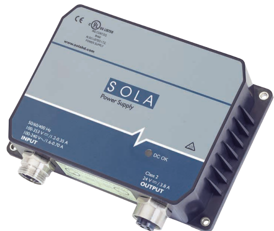
IP67 SCP-X SELF-SEALED POWER SUPPLY 5.4" x 7" x 1.8"